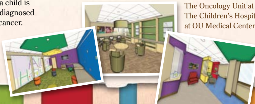
The Oncology Unit at The Children's Hospital at OU Medical Center

The Palliative Care Room provides a homelike environment with the support of hospital care for families who are facing the end of life. Beds right next to the patient's room allow the parents to be at the child's bedside at a moment's notice.